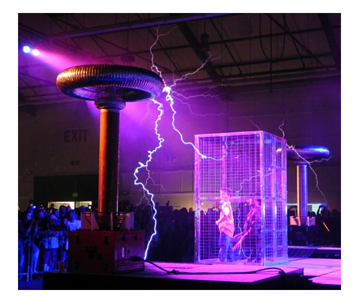
Figure 4. An image of a Faraday cage protecting people from a high voltage discharge from a Tesla coil.

field. The shielding material must surround the potential victim, mirroring a complete circuit, for the EM field to be cancelled out inside the enclosure.