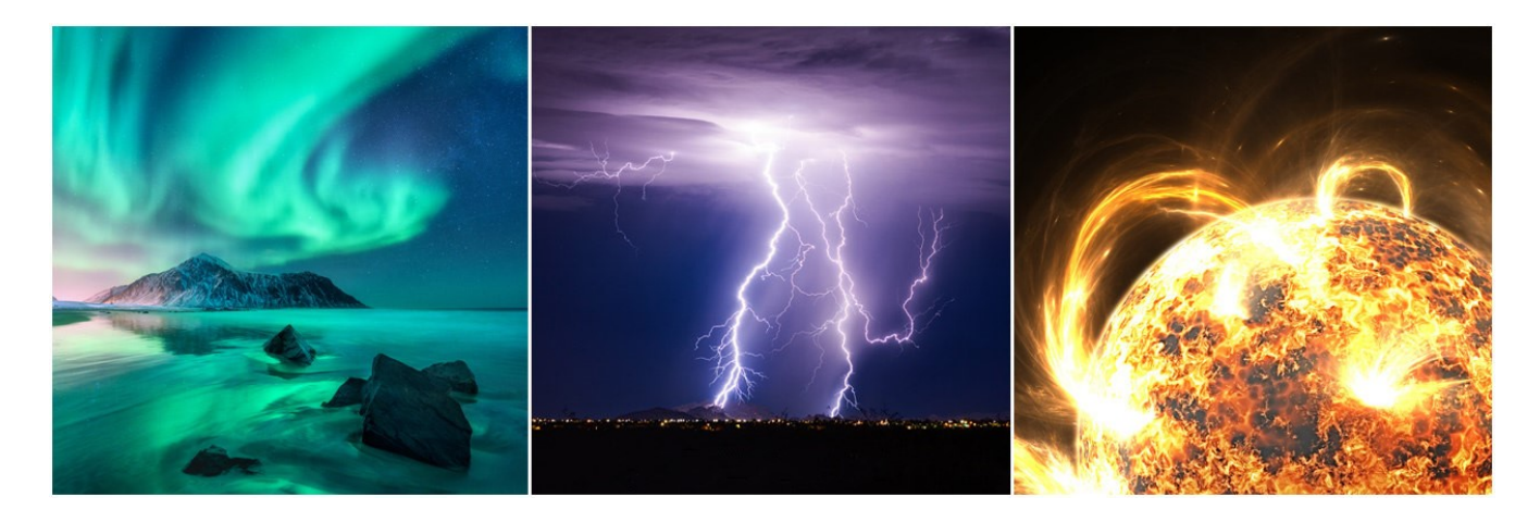
Figure 2. An image of some of the natural causes of Electromagnetic Interference (EMI). The Aurorae Borealis and Australis (L), Lightning Strikes (C) and Solar Flares (R) are some of the most visually stunning and exciting phenomena in the universe and are all manifestations of EMI [2].

across a large distance owing to the significant power being used in this technology. Even helpful sources of electromagnetic emissions, such as signals from cellular towers and satellite communication networks, can cause interference to certain devices if they are not adequately shielded. High voltage power lines, industrial electric motors and generators, TV and radio broadcast transmitters and even medical imaging systems can all be sources of EMI.