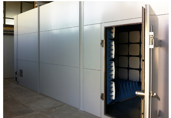
3M EMC COMPACT TEST CHAMBER