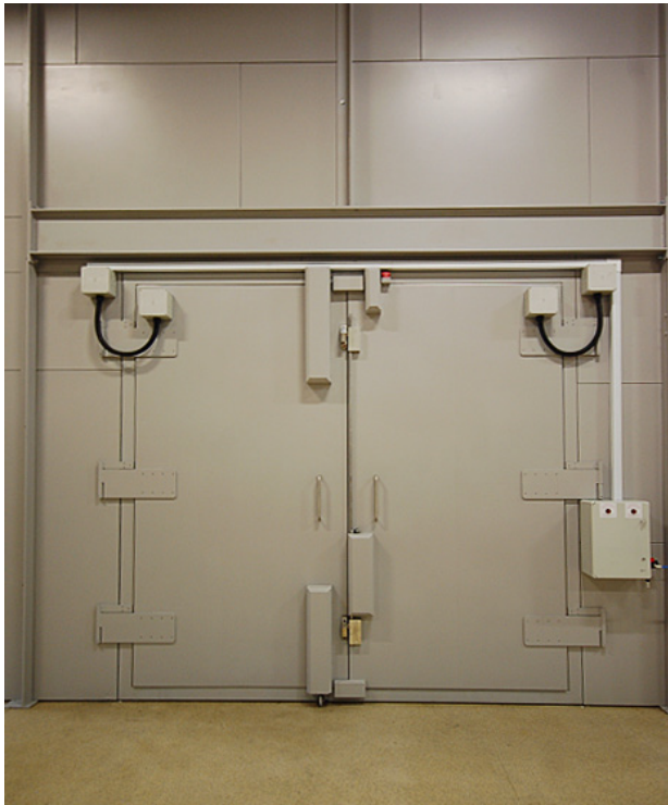
Double doors can have automatic or manual operation

see YouTube video: http://www.youtube.com/watch?v=Ru6E5nfyjEI